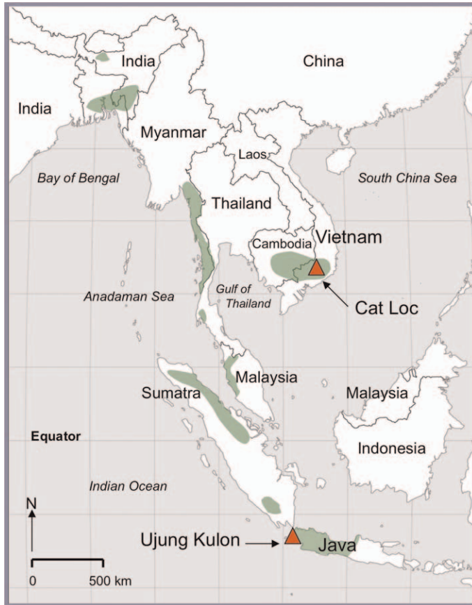
Fig. 3. — Rhinoceros sondaicus occurs in only 2 very small areas of southeastern Asia: Ujung Kulon, West Java (about 6°45'S, 105°15'E), and Cat Loc, Vietnam (about 11°35'N, 107°22'E; perhaps extinct). Green shading delimits areas of known historical distribution based on museum specimens collected beginning in the mid-1800s (Groves 1967; Rookmaaker 1980).

Java in Ujung Kulon National Park (Murphy 2004; World Conservation Monitoring Centre 2005) and Cat Loc in Cat Tien National Park in southern Vietnam (Santiapillai 1992; Schaller et al. 1990), if not now extinct in this latter locality. It once ranged throughout much of the central Indochinese subregion and the southwestern Sondaic subregion of southeastern Asia (Corbet and Hill 1992:map 106). Because of the critically endangered status of R. sondaicus , its general historical distribution and decline have been summarized repeatedly (e.g., Groves 1967; Harper 1945; Hoogerwerf 1970; Loch 1937; Rookmaaker 1980; Sody 1959). Lacking definitive records, we consider that generalized historical distribution of R. sondaicus (e.g., Foose and van Strien 1997; van Strien et al. 2008) to be overstated.