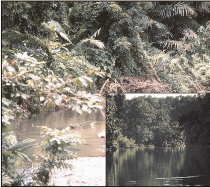
Fig. 7. —Typical stream and river (inset) habitats in Ujung National Park, West Java; Rhinoceros sondaicus often forages along the banks of such areas and uses them to wallow when those in the forest interior dry up.

Wallows also can be detected by well-worn paths, muddy vegetation, and trees that have been repeatedly rubbed with the head and horns of departing rhinoceroses. The reasons for wallowing include thermoregulation, skin conditioning, avoidance or removal of ectoparasites, and olfactory advertisement by impregnating the skin with the urine-rich water of the wallow (Ammann 1985; Hoogerwerf 1970; Schenkel and Schenkel-Hulliger 1969a; Sody 1959). When such wallows dry up during drought, R. sondaicus frequents edges of muddy river banks and tidal forests (Fig. 7; see video at http://www.arkive.org/javan-rhinoceros/rhinoceros-sondaicus/video-so08.html , accessed 15 September 2010).