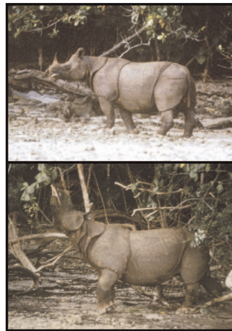
Fig. 1. —Rare images of an adult male Rhinoceros sondaicus from Ujung Kulon, West Java, in 1978; note the diagnostic dermal shields and prehensile upper lip used to grab forage in the bottom image.

Rhinoceros sivalensis Falconer and Cautley, 1847:pl. 73, figs. 2 and 3; pl. 74, figs. 5 and 6; pl. 75, figs. 5 and 6. Type locality “upper Siwaliks;” restricted to “Ratnapura series,” Ceylon by Deraniyagala (1938); fossil probably from the Upper Pleistocene.