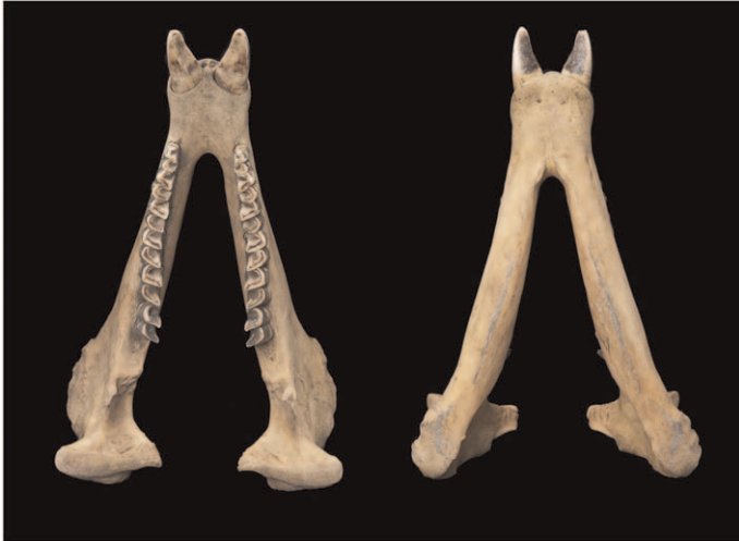
Fig. 5. —Dorsal (left) and ventral (right) views of the mandible of an adult Rhinoceros sondaicus (Natural History Museum [London] specimen 1876.3.30.1); note the large tusklike lateral incisors, characteristic of Asian rhinoceroses, and the 2 alveoli for the missing small central incisors (right mandible), characteristic of the genus Rhinoceros .

teeth of R. sondaicus “wear into ridges instead of a uniformly flat plane,” suggesting a browse diet (Lydekker 1907:35).