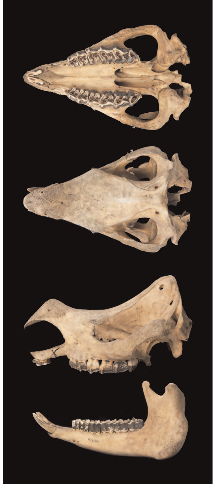
Fig. 4. —Ventral, dorsal, and lateral views of skull and lateral view of mandible of a mature male Rhinoceros sondaicus (Natural History Museum [London] specimen 1876.3.30.1) collected in the Sunderbunds, West Bengal, India, in 1876. Greatest length of skull is 523 mm.