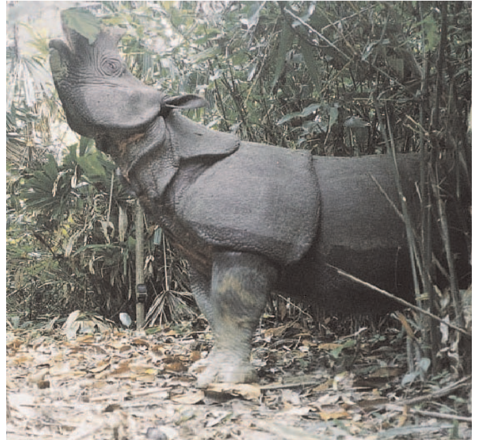
Fig. 6. —Male Rhinoceros sondaicus reaching for forage in a glade in Ujung Kulon National Park, West Java; reach of the prehensile upper lip is potentially increased by the mobility of the premaxillae in all but the most-aged adults; dermal neck folds and body shields are evident.

Tree species, particularly their saplings, and woody shrubs in second-growth forests dominate selected food items of R. sondaicus in West Java and include especially Spondias pinnata , Amomum , Leea sambucina , and Dillenia excelsa (Ammann 1985). Hoogerwerf (1970) mentions Glochidion zeylanicum , Desmodium umbellatum , Ficus septica , Pandanus , Lantana camara , and Vitex negundo —only 1 of which is in Ammann's list (at least at species level). Ammann (1985) noted that a large number of species of climbers were in the diet. R. sondaicus eats plants that have significant defenses against herbivory such as spines and thorns; Hoogerwerf (1970:105) noted that swamp thistle ( Acanthus ilicifolius ) and randu leuweung ( Gossampinus heptaphylla ) were eaten “without demur.” While fruits such as those of kawung palm ( Arenga pinnata ), papaya ( Carica papaya ), and kemlandingan ( Leucaena leucocephala —Hoogerwerf 1970) have been found in feces, they do not seem to form an important part of the diet of R. sondaicus (Ammann 1985), in contrast to Indian rhinoceroses in Chitawan National Park, Nepal, which relish fruits of the ubiquitous